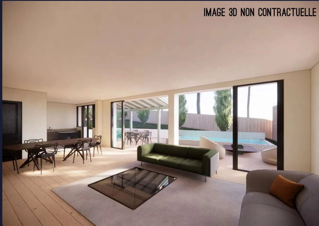
IMAGE 3D NON CONTRACTUELLE