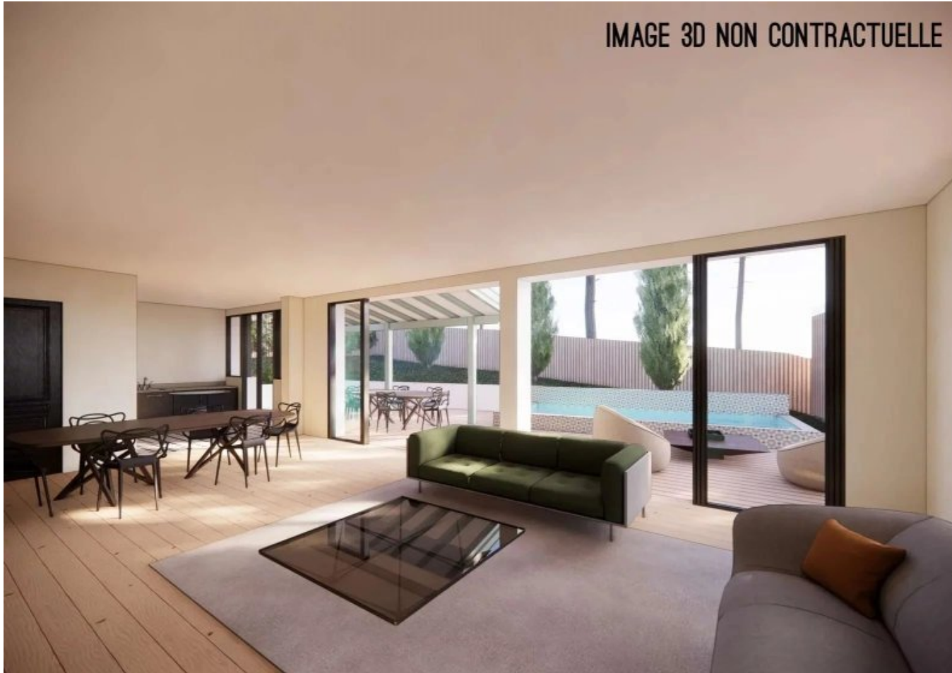
IMAGE 3D NON CONTRACTUELLE